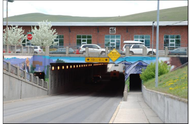
Orange Street Underpass, Missoula

The Downtown Holiday Inn 22 North Last Chance Gulch Helena, MT 59601