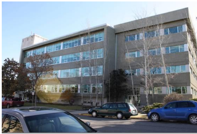
Walt Sullivan Building, Lewis and Clark County