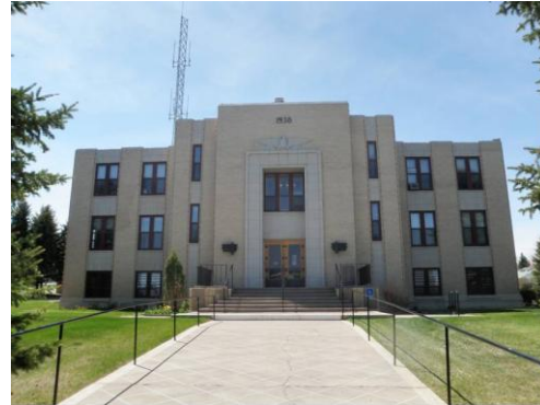
The Glacier County Courthouse, Cut Bank

Saturday, January 21, 2012 at the Downtown Holiday Inn (22 North Last Chance Gulch)